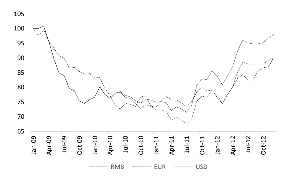
Notes: Indexes are based on data from the International Financial Statistics of the International Monetary Fund. A rise in the index denotes a depreciation of the real relative to foreign currencies.