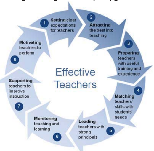
Figure 1: Eight teacher policy goals

The eight teacher policy Goals are functions that all high-performing education systems fulfill to a certain extent in order to ensure that every classroom has a motivated, supported, and competent teacher. These goals were identified through a review of evidence of research studies on teacher policies, and the analysis of policies of top-performing and rapidly-improving education systems. Three criteria were used to identify them: teacher policy goals had to be (i) linked to student performance through empirical evidence, (ii) a priority for resource allocation, and (iii) actionable, that is, actions governments can take to improve education policy. The eight teacher policy goals exclude other objectives that countries might want to pursue to increase the effectiveness of their teachers, but on which there is, to date, insufficient empirical evidence to make specific policy recommendations.