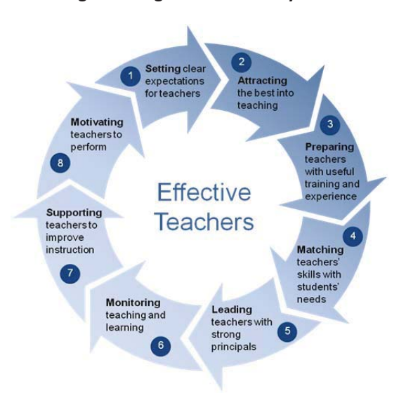
Figure 1: Eight Teacher Policy Goals

The eight teacher policy goals are functions that all high-performing education systems fulfill to a certain extent in order to ensure that every classroom has a motivated, supported, and competent teacher. These goals were identified through a review of evidence of research studies on teacher policies, and the analysis of policies of top-performing and rapidly-improving education systems. Three criteria were used to identify them: teacher policy goals had to be (i) linked to student performance through empirical evidence, (ii) a priority for resource allocation, and (iii) actionable, that is, actions governments can take to improve education policy. The eight teacher policy goals exclude other objectives that countries might want to pursue to increase the effectiveness of their teachers, but on which there is to date insufficient empirical evidence to make specific policy recommendations.