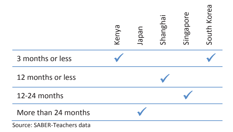
Figure 4. Required classroom experience, primary school teachers

Once appointed in schools, principal teachers are officially expected to help induct new teachers into the system, although there is no formal induction program.