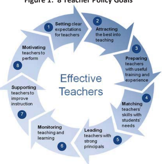
Figure 1: 8 Teacher Policy Goals

The eight Teacher Policy Goals are functions that all high-performing education systems fulfill to a certain extent in order to ensure that every classroom has a motivated, supported, and competent teacher. These goals were identified through a review of evidence of research studies on teacher policies and the analysis of policies of top-performing and rapidly-improving education systems. Three criteria were used to identify them. Teacher policy goals had to be: (i) linked to student performance through empirical evidence; (ii) a priority for resource allocation; and (iii) actionable, that is, actions governments can take to improve education policy. The eight teacher policy goals exclude other objectives that countries might want to pursue to increase the effectiveness of their teachers, but on which there is to date insufficient empirical evidence to make specific policy recommendations.