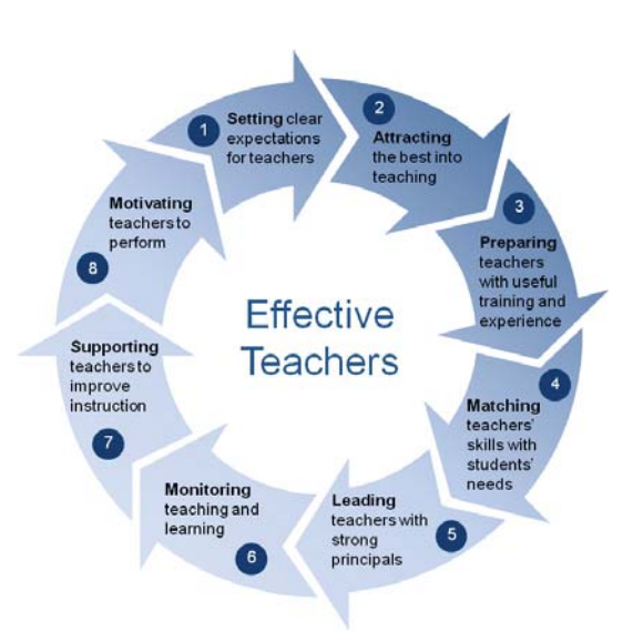
Figure 1: 8 Teacher Policy Goals

The eight teacher policy goals are functions that all high-performing education systems fulfill to a certain extent in order to ensure that every classroom has a motivated, supported, and competent teacher. These goals were identified through a review of evidence of research studies on teacher policies, and the analysis of policies of top-performing and rapidly-improving education systems. Three criteria were used to identify them: teacher policy goals had to be (i) linked to student performance through empirical evidence, (ii) a priority for resource allocation, and (iii) actionable, that is, actions governments can take to improve education policy. The eight teacher policy goals exclude other objectives that countries might want to pursue to increase the effectiveness of their teachers, but on which there is to date insufficient empirical evidence to make specific policy recommendations.