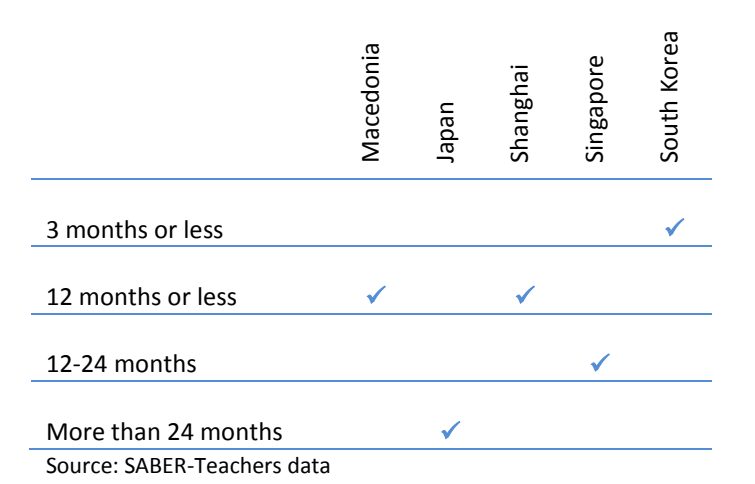
Figure 4. Required classroom experience, primary school teachers

The classroom experience required of teacher trainees during initial education is less than twelve months—approximately 230 hours for primary school teachers, and varying widely from 10 hours to 100 hours for secondary school teachers— Figure 4. Teacher candidates who purse a consecutive model of education, obtaining their BA in a subject area first and then pursing a teaching certification, much have a minimum of 45 days teaching practice. In high-performing systems, programs aimed at facilitating new teachers' transition into teaching for both primary and secondary school teachers are usually longer than 7 months. These programs have the potential to make teachers more effective in the classroom and reduce teacher turnover.