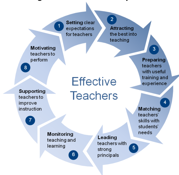
Figure 1: 8 Teacher Policy Goals

The 8 Teacher Policy Goals are functions that all high-performing education systems fulfill to a certain extent in order to ensure that every classroom has a motivated, supported, and competent teacher. These goals were identified through a review of evidence of research studies on teacher policies, and the analysis of policies of top-performing and rapidly improving education systems. Three criteria were used to identify them: teacher policy goals had to be (i) linked to student performance through empirical evidence, (ii) a priority for resource allocation, and (iii) actionable, that is, actions governments can take to improve education policy. The eight teacher policy goals exclude other objectives that countries might want to pursue to increase the effectiveness of their teachers, but on which there is to date insufficient empirical evidence to make specific policy recommendations.