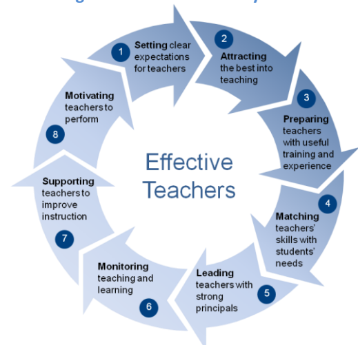
Figure 1: 8 Teacher Policy Goals

To offer informed policy guidance, SABER-Teachers analyzes the information collected to assess the extent to which the teacher policies of an education system are aligned with those policies that the research evidence to date has shown to have a positive effect on student achievement. SABER-Teachers analyzes the teacher policy data collected to assess each education system's progress in achieving 8 Teacher Policy Goals: 1. Setting clear expectations for teachers; 2. Attracting the best into teaching; 3. Preparing teachers with useful training and experience; 4. Matching teachers' skills with students' needs; 5. Leading teachers with strong principals; 6. Monitoring teaching and learning; 7. Supporting teachers to improve instruction; and 8. Motivating teachers to perform (see Figure 1).