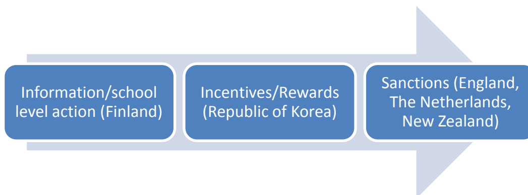
Figure 2: Consequences of Supervision

In all five systems, support for teachers may target instruction directly (for example, providing access to internal or external instructional coaches) or may focus on improving the learning environment (for example, providing additional physical and instructional resources, better coordination with social services for children's non-instructional needs, re-arrangement of school schedules to allow teachers more time to work together, and/or investment in formative assessment programs that enable teachers to better track individual student learning, etc.).