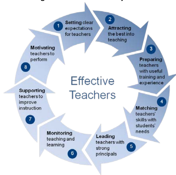
Figure 1: 8 Teacher Policy Goals

The 8 Teacher Policy Goals are functions that all high-performing education systems fulfill to a certain extent in order to ensure that every classroom has a motivated, supported, and competent teacher. These goals were identified through a review of evidence of research studies on teacher policies, and the analysis of policies of top-performing and rapidly-improving education systems. Three criteria were used to identify them: teacher policy goals had to be (i) linked to student performance through empirical evidence, (ii) a priority for resource allocation, and (iii) actionable, that is, actions governments can take to improve education policy. The eight teacher policy goals exclude other objectives that countries might want to pursue to increase the effectiveness of their teachers, but on which there is to date insufficient empirical evidence to make specific policy recommendations.