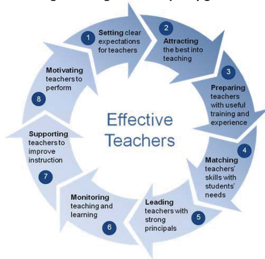
Figure 1: Eight teacher policy goals

The eight teacher policy goals are functions that all high-performing education systems fulfill to a certain extent in order to ensure that every classroom has a motivated, supported, and competent teacher. These goals were identified through a review of evidence of research studies on teacher policies, and the analysis of policies of top-performing and rapidly improving education systems. Three criteria were used to identify them: teacher policy goals had to be (i) linked to student performance through empirical evidence, (ii) a priority for resource allocation, and (iii) actionable, that is, actions governments can take to improve education policy. The eight teacher policy goals exclude other objectives that countries might want to pursue to increase the effectiveness of their teachers, but on which there is to date insufficient empirical evidence to make specific policy recommendations.