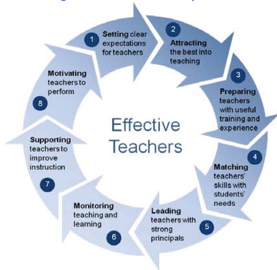
Figure 1: 8 Teacher Policy Goals

The 8 Teacher Policy Goals are functions that all high-performing education systems fulfill to a certain extent in order to ensure that every classroom has a motivated, supported, and competent teacher. These goals were identified through a review of evidence of research studies on teacher policies, and the analysis of policies of top-performing and rapidly-improving education systems. Three criteria were used to identify them: teacher policy goals had to be (i) linked to student performance through empirical evidence, (ii) a priority for resource allocation, and (iii) actionable, that is, actions governments can take to improve education policy. The eight teacher policy goals exclude other objectives that countries might want to pursue to increase the effectiveness of their teachers, but on which there is to date insufficient empirical evidence to make specific policy recommendations.