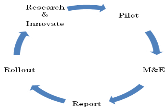
Figure 3: The JEI Project Planning and Implementation Cycle

The cycle begins with researching current innovations in education in general and ICT in education in particular. The next step is to select a certain number of the Discovery Schools in which to pilot the innovation. The number of selected schools depends on the idea, as well as funding support, the cost, and the readiness of schools to adopt the innovation. During this phase JEI assigns a project manager, who designs the project charter and project plan, as well as identifies anticipated risks. The implementation process then begins and a monitoring plan is established, involving frequent progress reports.